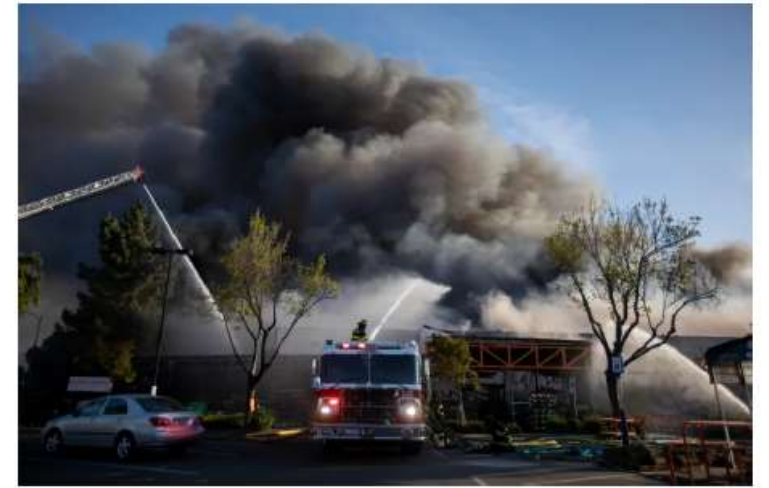
SAN JOSE, CALIFORNIA – APRIL 9: San Jose City Fire Department firefighters fight a fire at Home Depot on Blossom Hill Road in San Jose, Calif., on Saturday, April 9, 2022.

A 27-year-old San Jose resident was charged with arson and a series of thefts leading up to massive blaze; questions remain as to why the entire building was destroyed